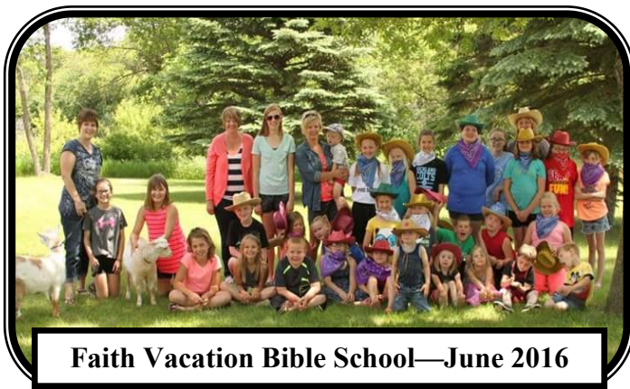
Faith Vacation Bible School—June 2016