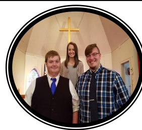
Senior Recognition May 2016